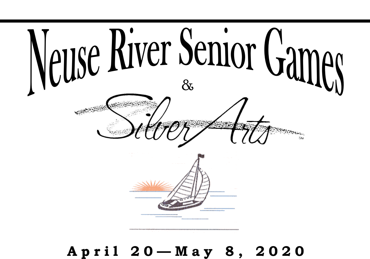
This program is sanctioned by the North Carolina Senior Games, Inc. NCSG Inc. is sponsored statewide by the North Carolina Division of Aging and Adult Services.

Neuse River Senior Games 406 Craven Street New Bern, NC 28560